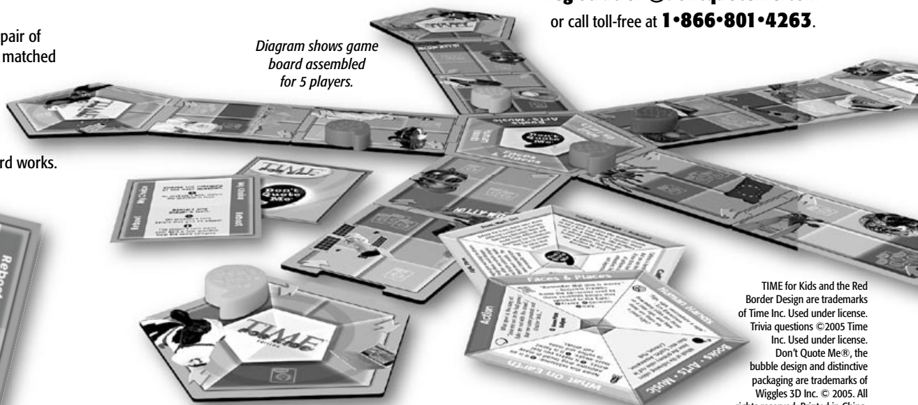
Diagram shows game board assembled for 5 players.

Register with us by sending an email to registration@dontquoteme.com or call toll-free at 1-866-801-4263 .